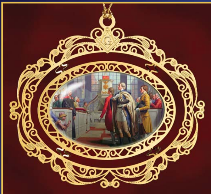
St. John's Day Observance

The George Washington Masonic Memorial is pleased to present this year's holiday ornament: St. John's Day Observance. It depicts General Washington and his officers attending Christ Church in Philadelphia for a St. John's Day Observance on December 28, 1778. Under the auspices of the Grand Lodge of Pennsylvania, the Observance raised money to help alleviate suffering of the citizens during the British occupation. The British evacuated Philadelphia in June of 1778. In December, Washington visited Philadelphia where Congress was in session. While there, the Grand Lodge of Pennsylvania celebrated the festival of St. John the Evangelist. Washington was present on the occasion, and was honored with the chief place in the procession.