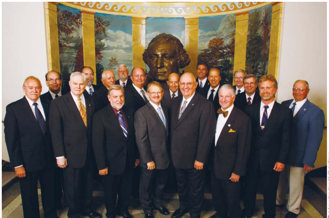
Board of Directors gather in Grand Masonic Hall in front of a bronze bust of Washington and beautiful mural. The newly refurbished east niche is part of several renovation projects in preparation for the Memorial Association's 100 th Anniversary in 2010.

At the Semi-Annual Board of Directors Meeting held August 8-9, 2008 at the Memorial, the Board took a strong and united stand in favor of the creation of a long-range strategic plan for the Association. The Board emphasized that effective planning, fund raising and awareness programs could not be developed without a decisive plan. As a result, a task force was established and they will present the long-range plan at the next Board meeting in February in Anaheim. The Board is already committed to several renovations, many of them currently underway at the Memorial. Grand Masonic Hall will be enclosed and air conditioned to allow use of the space throughout the year. Elevators will also be installed. The Tower elevators will be upgraded to provide access to new exhibits in the Tower rooms. The top floor will be renovated by adding windows,