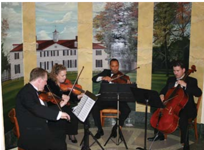
A classical string quartet entertains guests from the east niche of Grand Masonic Hall. This scene of Mount Vernon is one of three new murals the Memorial recently commissioned.

The Conference was held for the first time this year in Washington, D.C. The theme was "Universal Fraternity in Action" and emphasized how Freemasons could better embrace today's changing world while preserving the traditions of the Fraternity.