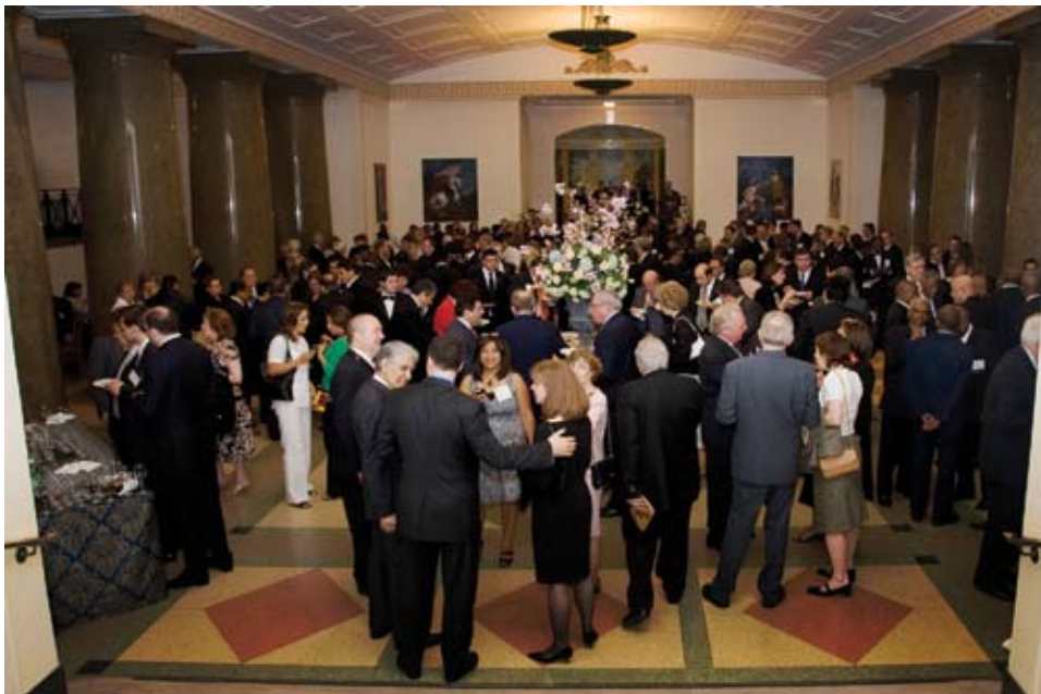
World Conference delegates gather in Grand Masonic Hall for an elegant reception hosted by the Memorial.

Over 600 people from around the world visited the George Washington Masonic Memorial on May 7 at a reception the Memorial hosted as part of the 9 th World Conference of Masonic Grand Lodges.