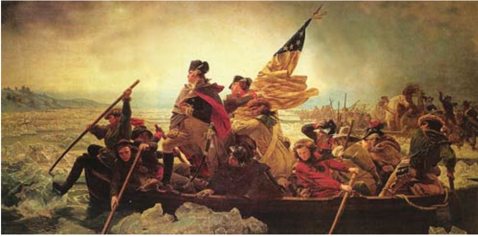
Washington's harrowing trek across the icy Delaware proved a turning point in the Revolution and strengthened his resolve to push on to victory. (Oil on canvas by Emanuel Gottlieb Leutze, 1851)

During this holiday season we should pause to remember a pivotal point in the American Revolution. Just six months after the Declaration of Independence, the American Revolution was all but lost. A powerful British force had routed the Americans at New York, occupied three colonies, and advanced within sight of Philadelphia. George Washington lost 90 percent of his army and was driven across the Delaware River. Panic and despair spread through the states. Washington – and many other Americans – refused to let the Revolution die. Even as the British and Germans spread their troops across New Jersey, the people of the colony began to rise up against them. George Washington saw his opportunity and seized it. On Christmas night, as a howling nor'easter struck the Delaware Valley, he led