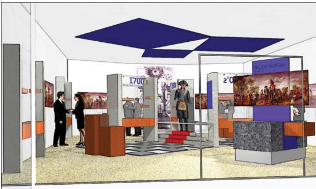
Artist rendering of the new exhibit on American Freemasonry with George Washington at the center in full Masonic regalia, inspiring visitors to improve themselves as they improve their community.