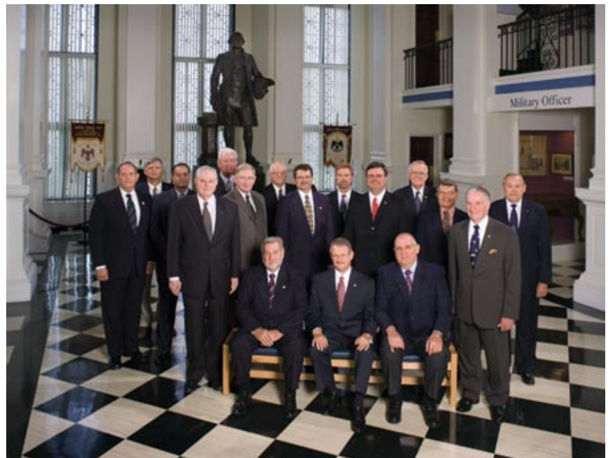
The Board of Directors met at the Memorial in August for the Association's Semi-Annual Board Meeting. They are pictured here in the George Washington Museum.

and healthy future for the Memorial. The next Board of Directors meeting will be held at the Conference of Grand Masters in Portland, Oregon in February.