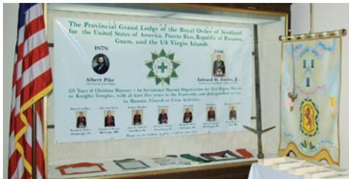
An impressive exhibit provided by the Provincial Grand Lodge, U.S.A. Royal Order of Scotland is on display in the Memorial through December.