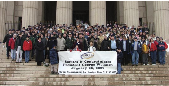
PA DeMolay, Job's Daughters, Rainbow Girls and their family and friends gather on the front steps of the Memorial before heading downtown for the Presidential Inaugural.

Officers presented $1,000 in honor of R.W. Past Grand Master of the Grand Lodge of Pennsylvania and long-time advisor